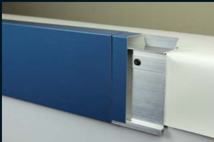
TerminEdge EX Fascia