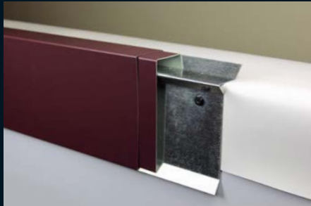
TerminEdge AR Fascia