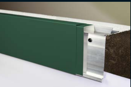
TerminEdge EX MB Fascia

There's a TerminEdge product for every application.