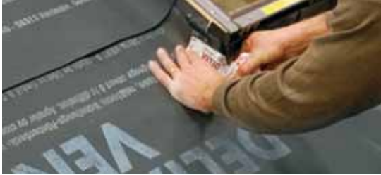
Very tear-resistant. Extraordinarily sure footing.