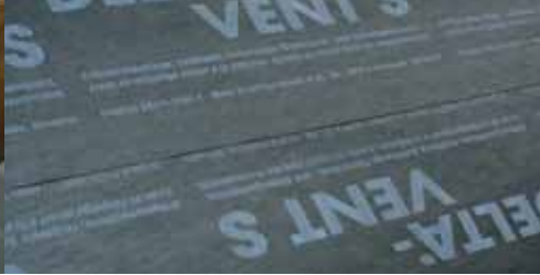
Product identification markings serve as guide for overlap edge.