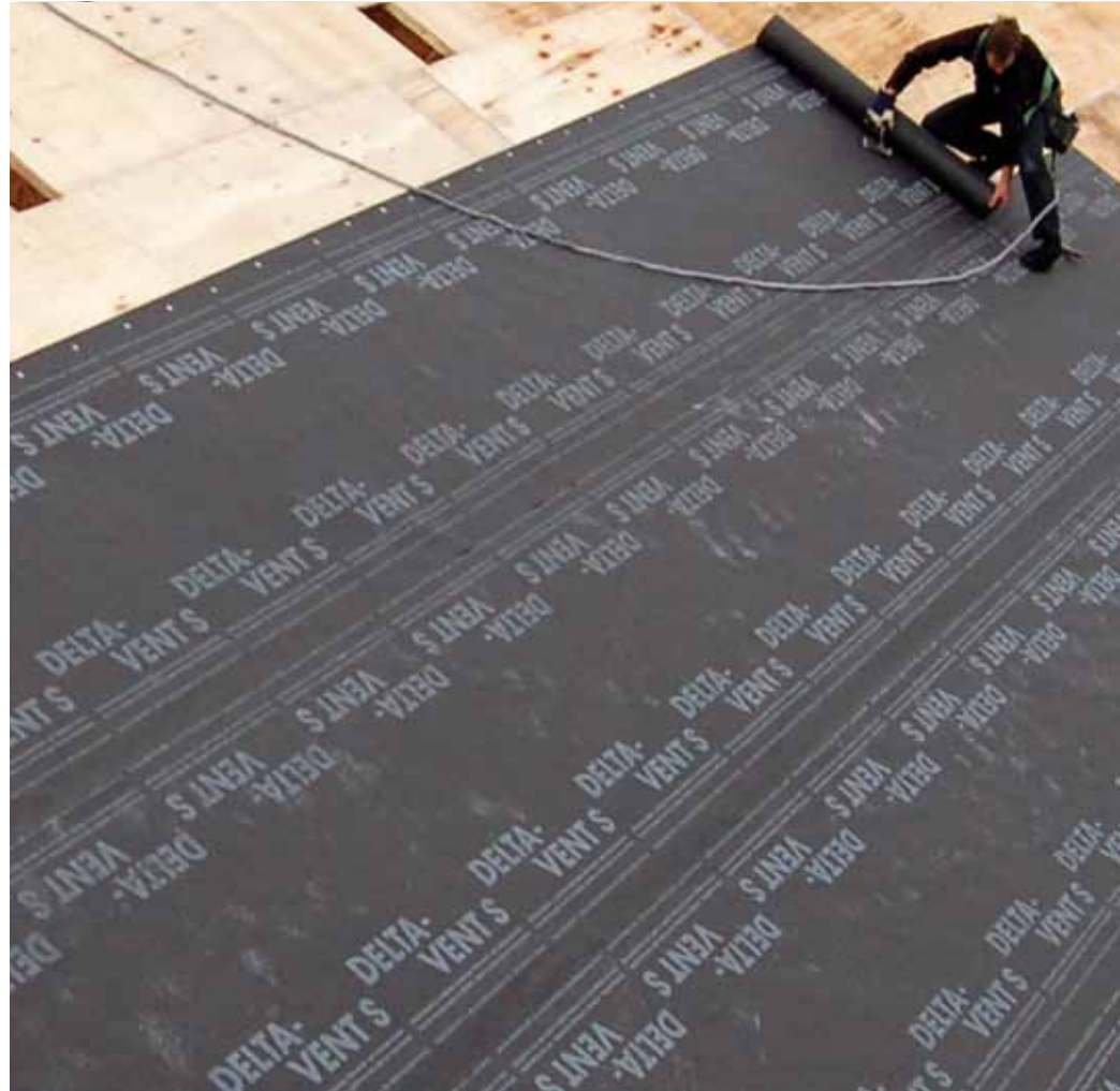
DELTA®-VENT S, the 3-ply composite, provides for secure and fast installation.

Evaluation Report (Certification) ICC-ESR 2625