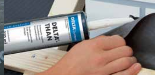
Watertight connections and overlaps with DELTA®-THAN sealant.